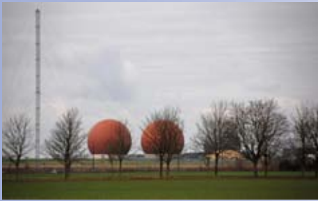
USAF Croughton near Northampton/Oxford

engined B-52H Stratofortress bombers were joined by two B-2A Spirit stealth bombers from Whiteman Air Base, Missouri apparently on a training exercise. ( Excerpts from Gloucestershire Echo and RAF website ).