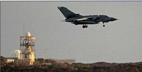
British Tornado fighter jet lands at the RAF's Akrotiri base in Cyprus. Each flight to Iraq costs £35,000.

Bombing has not been decisive in any recent conflict. Far from it. It has been counterproductive and an expensive waste. In the past, pilots have quickly run out of targets. It will be even more difficult now, as RAF Tornado crews have already discovered, to find them as they continue to search for Islamic State (Isis) fighters in Iraq now.