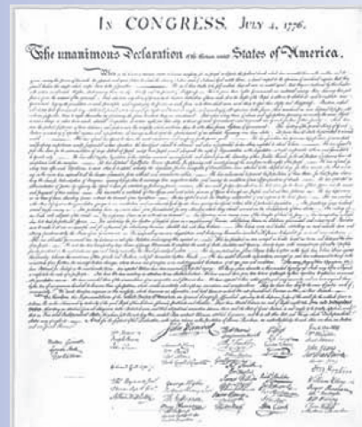
THE ORIGINAL DECLARATION – 1776

Annual Demonstration at NSA Menwith Hill