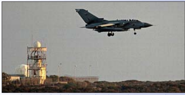
British Tornado fighter jet lands at the RAF's Akrotiri base in Cyprus. Each flight to Iraq costs £35,000.

Bombing has not been decisive in any recent conflict. Far from it. It has been counterproductive and an expensive waste. In the past, pilots have quickly run out of targets. It will be even more difficult now, as RAF Tornado crews have already discovered, to find them as they continue to search for Islamic State (Isis) fighters in Iraq now.